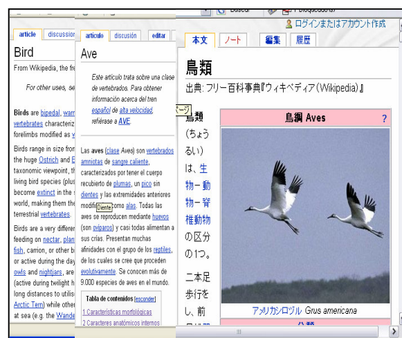
Figure 1. The article “bird” in English, Spanish and Japanese

Take all articles titles that are nouns or named entities and look in the articles’ contents for the box